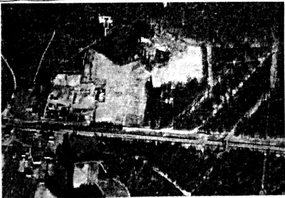
Allied aerial photo of Sobibor

• Aerial photos snapped during WW II by Allied forces showed no holes in the ceilings of any “extermination centers”