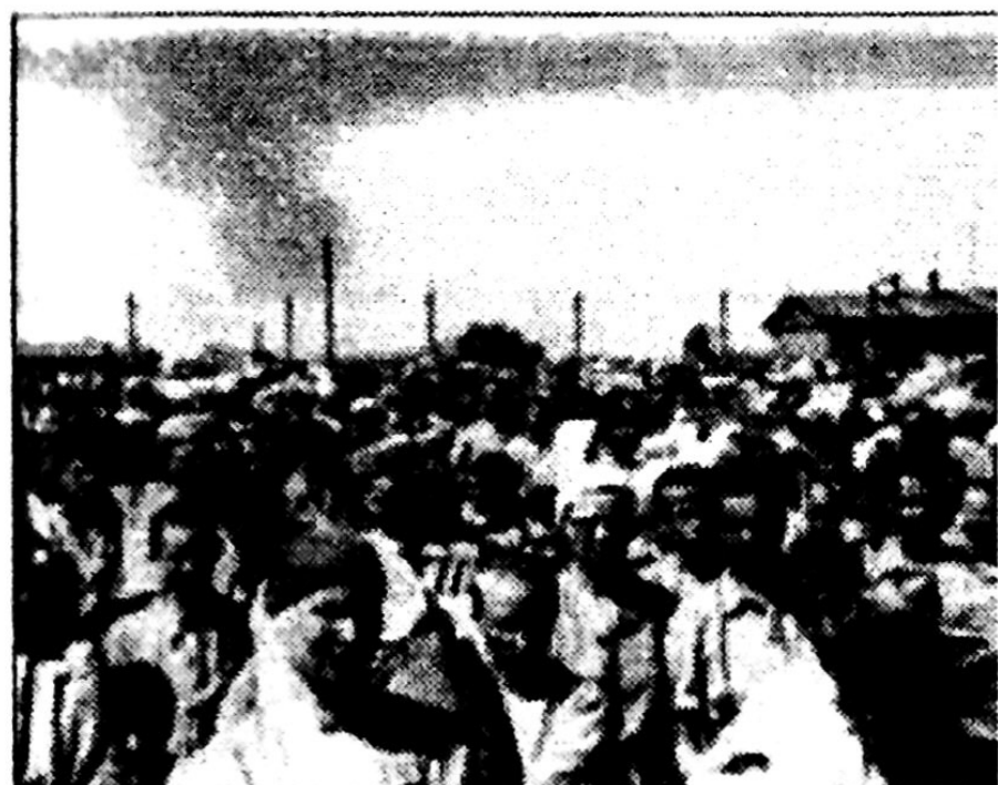
Wiesenthal Center's altered photo with "smoke" airbrushed into the scene