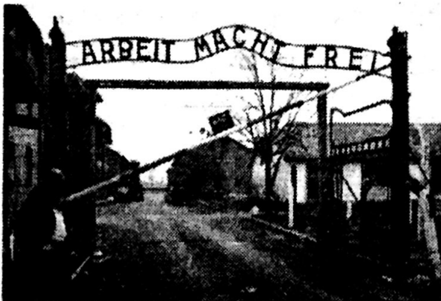
Arbeit Macht Frei - "Work Will Make You Free"

would they be housed in these barracks? The answer is simple: the Jews were housed at Auschwitz so that they could work in this industrial center where shipments of coal were transformed into gasoline to support the German war economy.