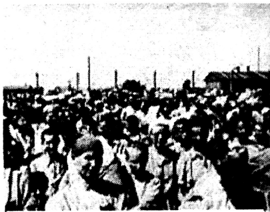
Original photo without any smoke emitted from "crematoria"

• Nazi SS driver Richard Boerk deceived jurors at Frankfurt's Auschwitz trial that ran from 1963 to 1965 by proclaiming that after Jews were killed in gas chambers, "The door was opened and we could still see a blue vapor floating over a gigantic pile of bodies." However, if Zyklon B were used—as is the official story—the hydrocyanide gasses emitted from it would be colorless. It's impossible for any type of blue vapors to exist.