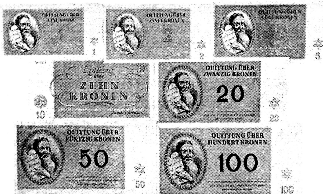
Examples of work camp currency

Taken one step further, not only weren't there any